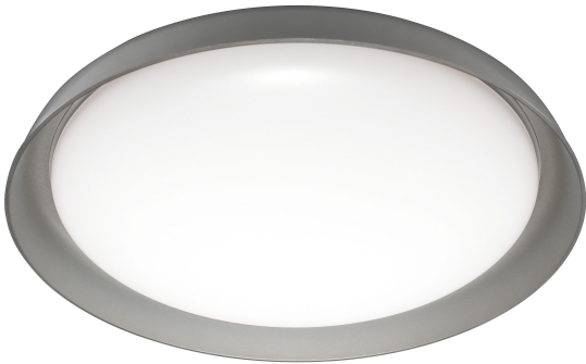
Plate | Decorative ceiling luminaires with WiFi technology