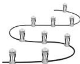
2 SMART+ WIFI GARDEN 9 Dot