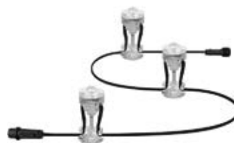
3 SMART+ WIFI GARDEN 3 Dot extension